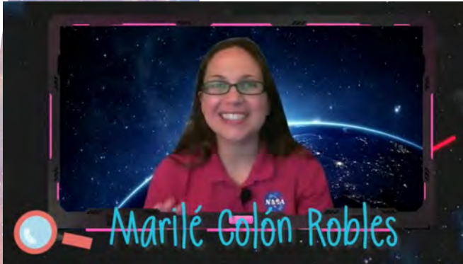
Mentes Curiosas en la NASA feature. https://youtu.be/rEf7yTAP-Ss?t=1003